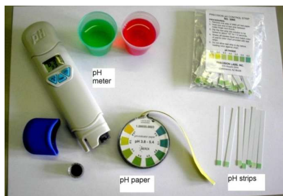
Figure 2. Equipment needed for measuring pH values